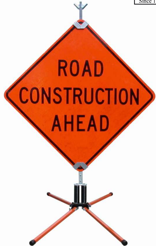
STF18-RGB with 48" x 48" rigid sign