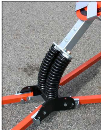
STF18 Dual heavy duty springs for wind relief