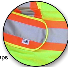
Adjustable side straps for a custom fit

The V1000 vest meets ANSI/ISEA 107-2004 Class 2 standards and features solid polyester material with a five point tear away design, one size fits most adjustability, triple-trim reflective stripes, expandable radio pocket, pencil pocket, mic clip, message provision on the back, and hook and loop closure.