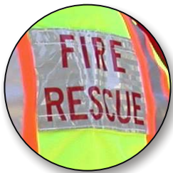
Optional Reflective Message Patches