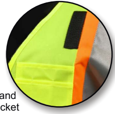
Mic clip and pencil pocket