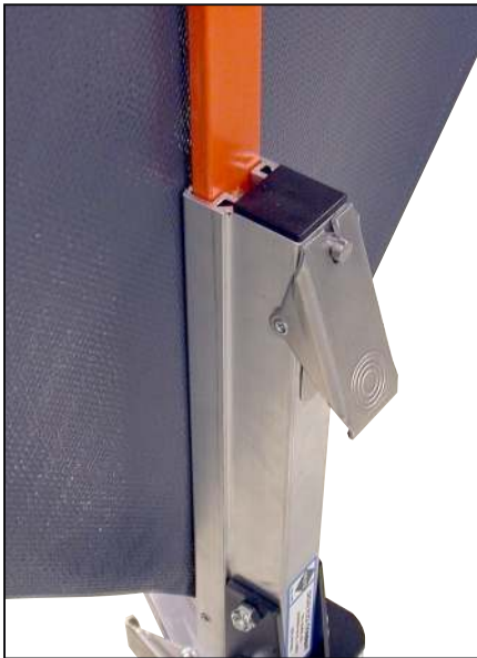
The TF12C features the Channel Style sign holder for roll-up signs with 3/8" vertical ribs.