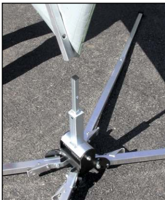
Stablock™ (Fold & Roll)

Stablock sign holder is used to hold our popular Fold & Roll™ sign panel. Vertical aluminum tubing slides down over small diameter base fitting. Locks in place with a spring button. This option provides the fastest set-up and most compact storage dimensions available.