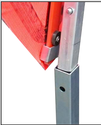
"P" Style for 1" Sq. Tubes

Clamps the roll-up sign to the stand utilizing bottom rectangular plastic pocket on roll-up sign panel. Spring loaded catch automatically locks sign into base, a lift of the lever releases to sign.