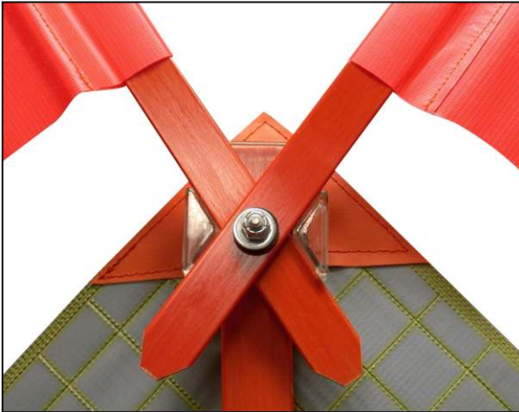
FFS-1 Folding Flag System

This permanently attached folding flag system insures that flags will always be handy and ready to deploy. Rotate flags from their storage position to the display position for use, reverse for storage. Flags are 18" x 18" blaze orange vinyl coated nylon on 1" wide fiberglass staffs. FFS-1 has 2 flags, FFS-13 has 3 flags.