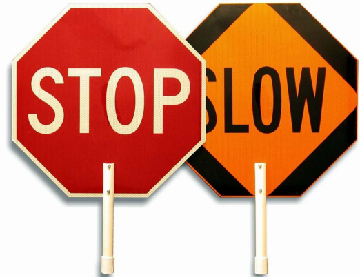
A24HI Stop/Slow Paddle