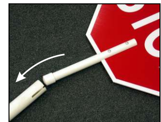
C18NR comes with 8" handle and slides into extension handles for added height