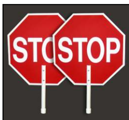
STOP/STOP also available

New 18" octagon shaped stop/slow paddles are ultra lightweight and economical. Made from corrugated coroplast plastic panels, they come with an 8" plastic handle and fasteners for quick screwdriver assembly. The C18NR is available in non-reflective STOP/SLOW and STOP/STOP versions, add a 5' or 6' pvc plastic handle for extra height. Handles are slotted at the top to engage the paddle preventing spinning and keeping the sign face properly oriented to traffic.