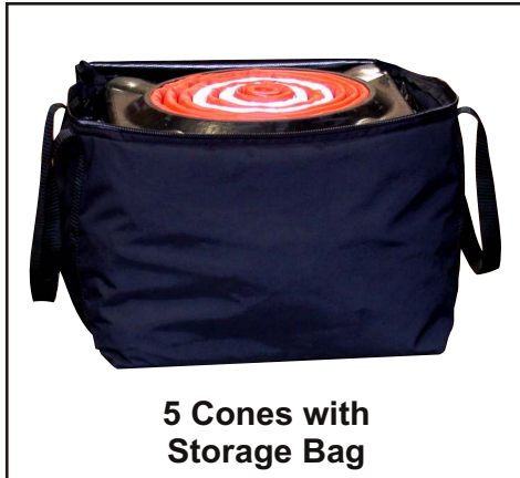
5 Cones with Storage Bag