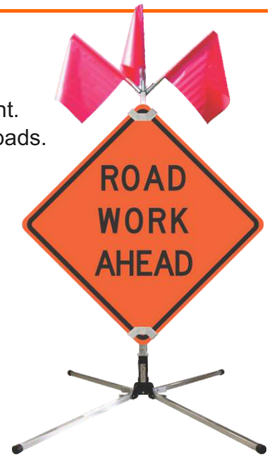
ESFR stand with 48" rigid sign