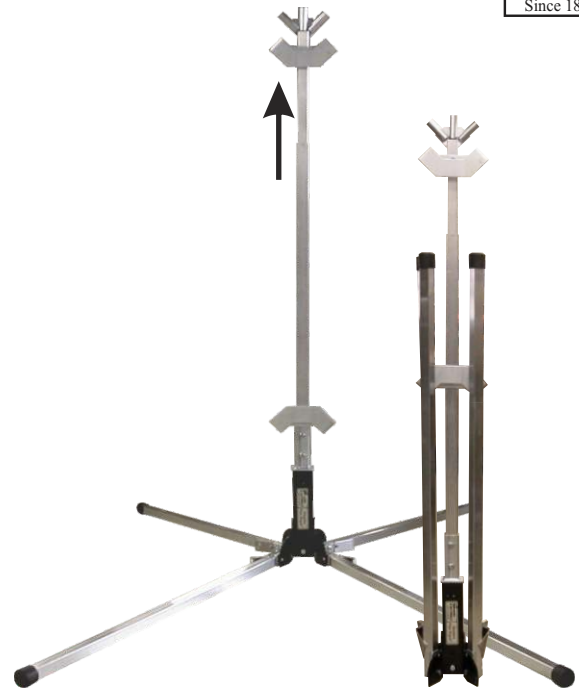
ESFR in deployed and storage configurations