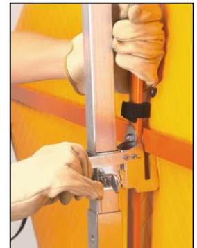
Roll-up sign bracket