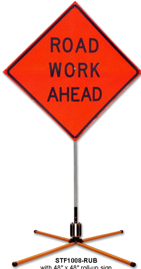
STF1008-RUB with 48" x 48" roll-up sign