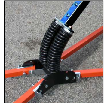
Dual heavy duty springs for wind relief