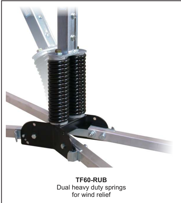
TF60-RUB Dual heavy duty springs for wind relief