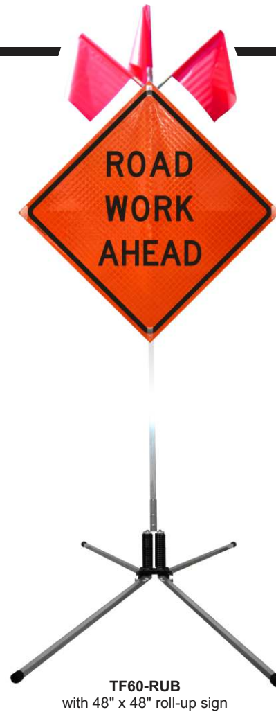
TF60-RUB with 48" x 48" roll-up sign