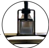
Rigid Sign Brackets