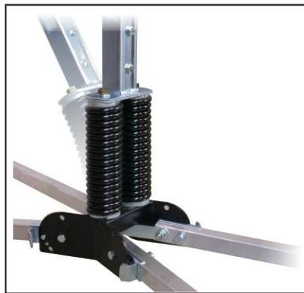
TF84-RG/RU Dual heavy duty springs flex for wind relief