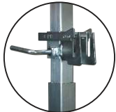
Roll-Up Sign Bracket