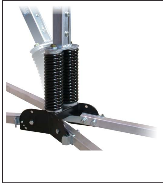
TF84-RGB Dual heavy duty springs flex for wind relief