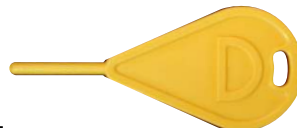
Key - #AC4D-KEY