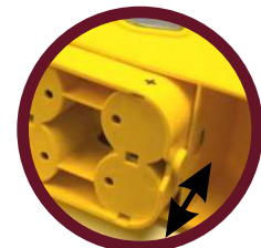
Battery Case Snaps In and Out