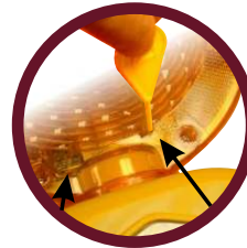
On/Off and Mode Switches