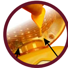
On/Off and Mode Switches