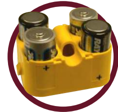
Battery Case w/Battery Direction Indicators