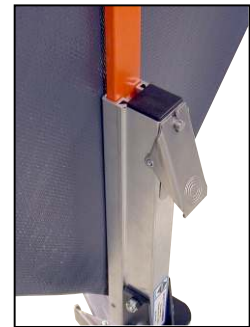
Channel Style sign holder