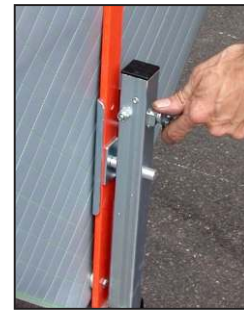
ScrewLock™ sign holder