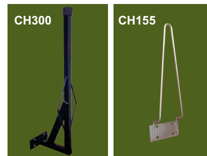
CH155 - Holds 18" & 28" cones CH300 - Holds 36" cones