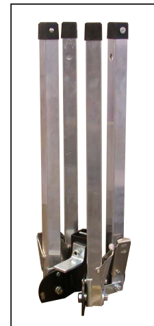
DL1500 Storage Position