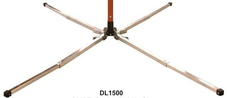
DL1500 w/ 36" Reflective Roll-Up Sign