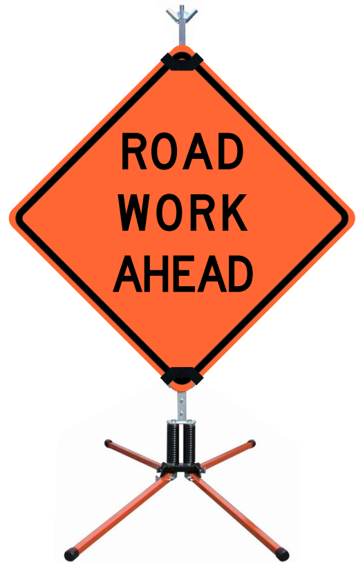
STF18-RGB with 48" x 48" rigid sign