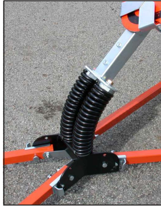
STF18 Dual heavy duty springs for wind relief