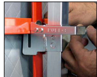
Roll-up sign bracket RUB3314 included