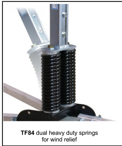
TF84 dual heavy duty springs for wind relief